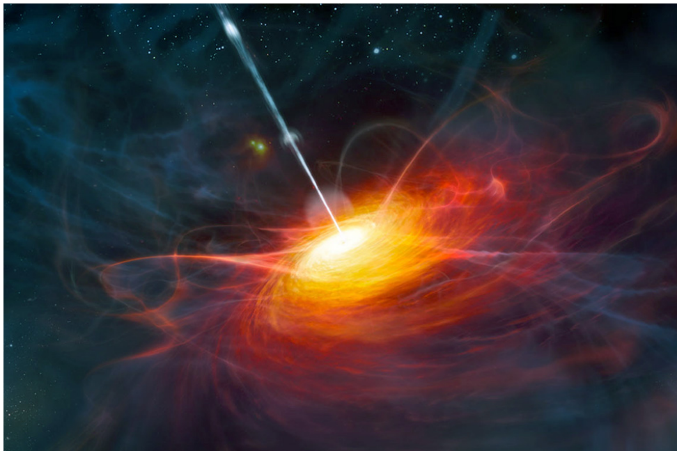
Does Free Will Exist? Ancient Quasars May Hold the Clue