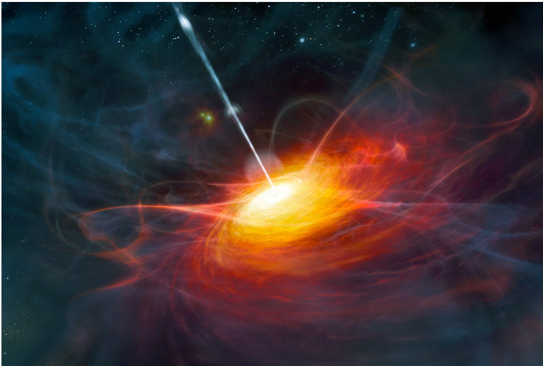
Artistic rendering of ULAS J1120+0641, a very distant quasar.