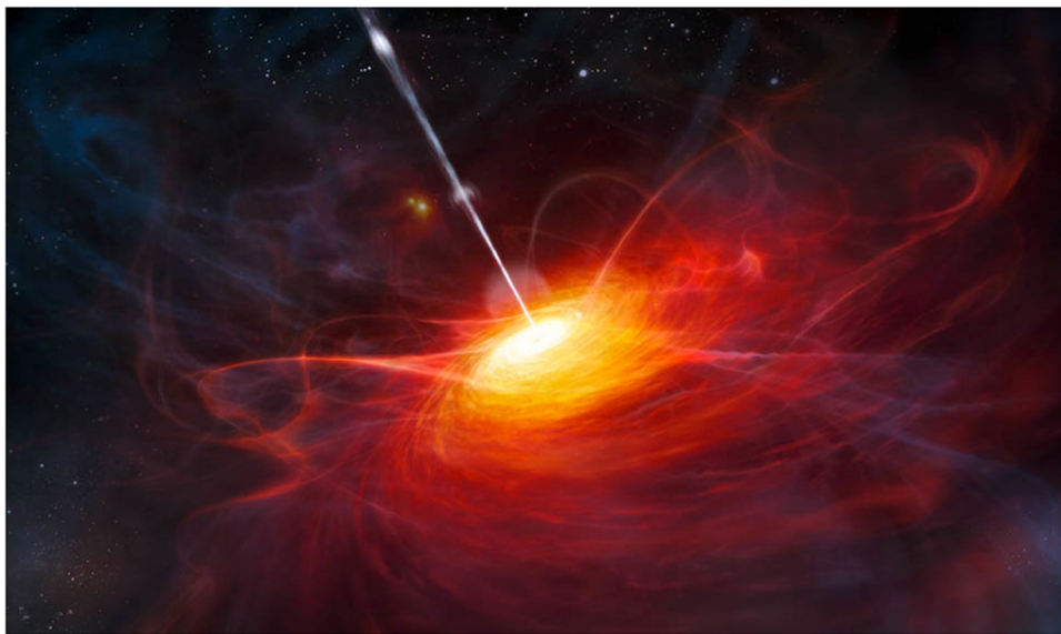
Artist's conception of a quasar, a bright, young, galaxy powered by a voracious supermassive black hole.