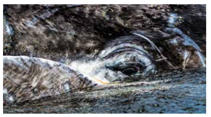
Bigger eyes let an animal see more stars. A whale's large pupil might enable it to see more than twice as many stars as a human.

across and with pupils 9 centimeters wide, this squid could potentially see stars as faint as magnitude 12, which is truly staggering!