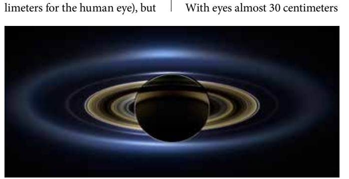
The ringed planet's shadow blocks out the Sun in this 140-image mosaic of Saturn's surroundings captured by NASA's Cassini mission.

What about whales, basking on a starlit ocean surface at night? Remarkably, despite the often gigantic sizes of whales, their eyes are not as large as one might think. Even the largest whale eyes studied are only around 70 millimeters across (compared to around 25 millimeters for the human eye), but