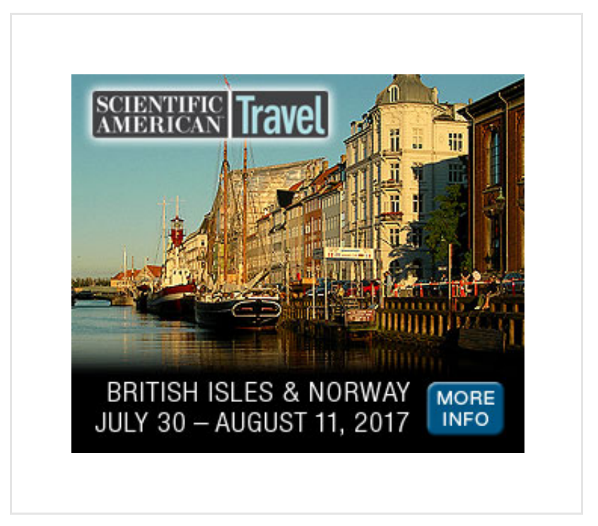
ADVERTISEMENT | REPORT AD

Scientific American is part of Springer Nature, which owns or has commercial relations with thousands of scientific publications (many of them can be found at www.springernature.com/us). Scientific American maintains a strict policy of editorial independence in reporting developments in science to our readers.