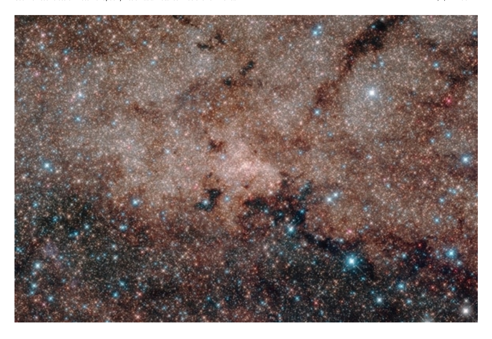
The light from distant stars is used to fix settings in a new version of the iconic Bell test.

A version of an iconic experiment to confirm quantum theory has for the first time used the light of distant stars to bolster the case for a phenomenon that Albert Einstein referred to as "spooky action at a distance".